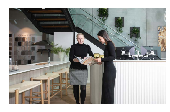
Choose more upgrades with a Rawson Homes Design Studio upgrade voucher.