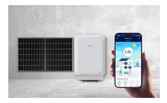
Power your home with an upgraded 6.5kW solar system, 10kW/h battery and mySolarEdge app.