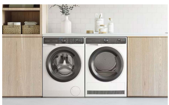
Keep your energy bills clean with an energy efficient Westinghouse washer and dryer set.