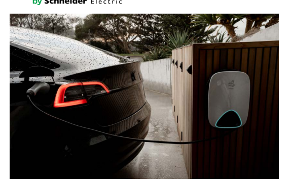
Charge your vehicle with a bonus Clipsal EV charging system.