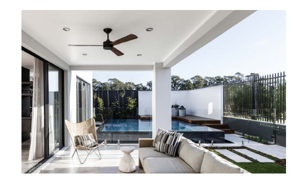
Dine comfortably on your alfresco with a bonus fan.