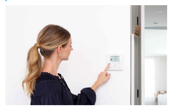
Cool off with an upgraded Daikin premium inverter ducted air conditioning system and control pack.