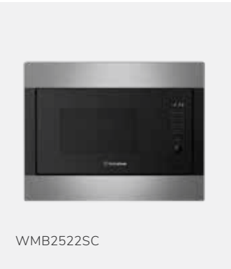
Westinghouse built-in microwave (including trim kit, installation by electrician)