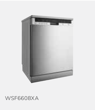
Westinghouse dishwasher (plumbing install of dishwasher)