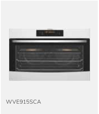
Westinghouse 90cm oven