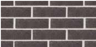
Dark and Stormy