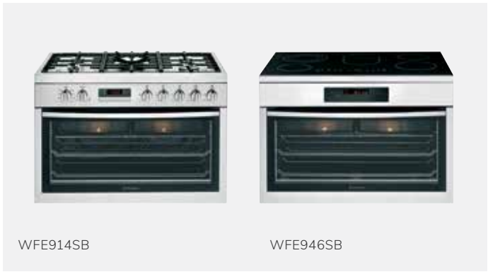
Westinghouse 90cm dual fuel freestanding cooker