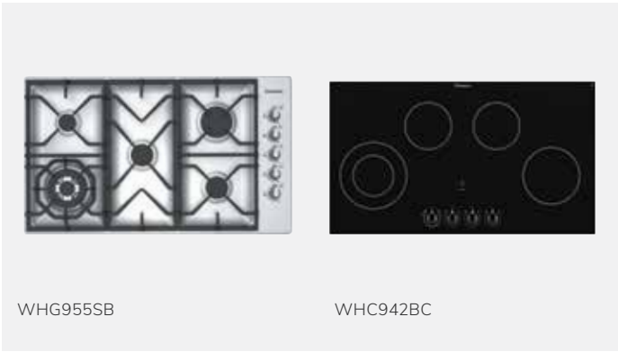
Westinghouse 90cm gas cooktop