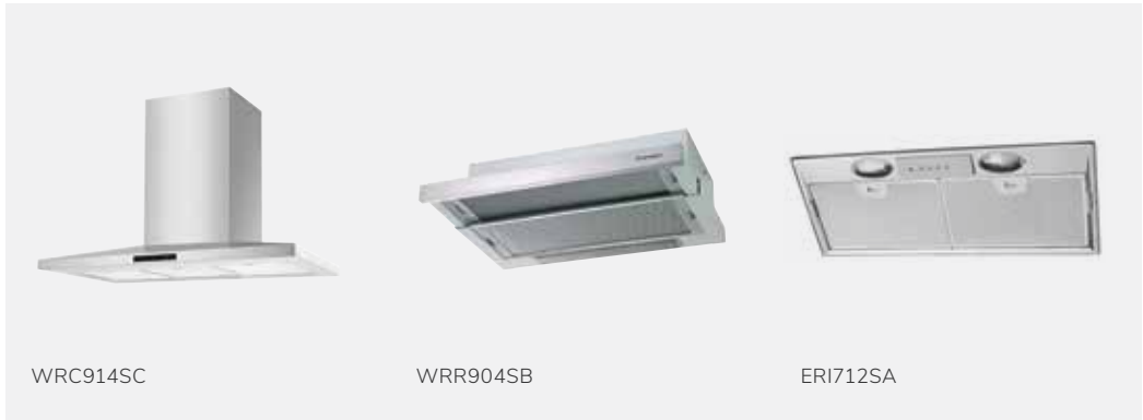
Westinghouse 90cm canopy rangehood